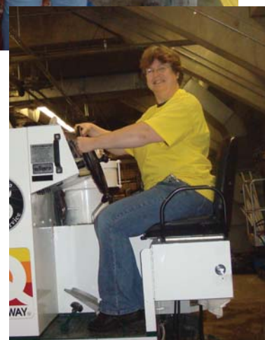
Wait...is that our Pirate Queen driving the Zamboni?